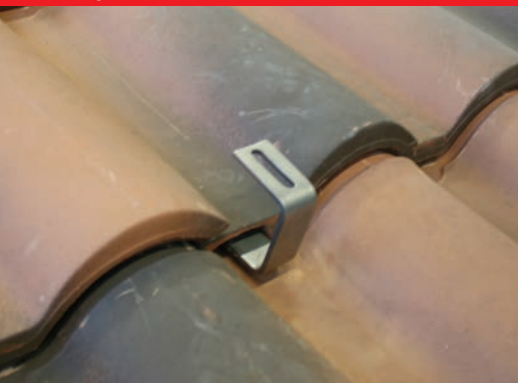
Hook - profile - clamp