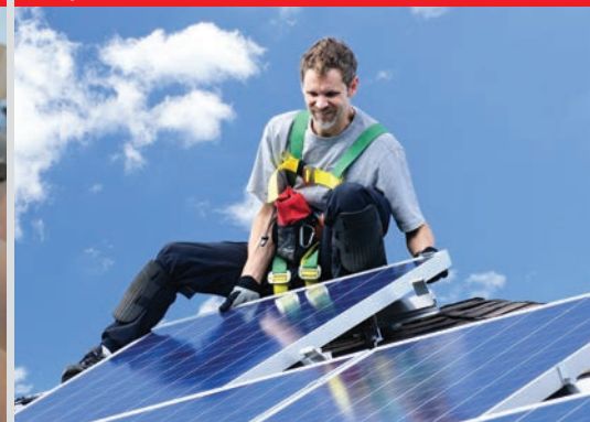
13 kWp plant on pitched roof